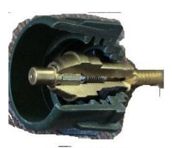
TYPE-1 (CGA 791)

The excess-flow check-valve is sensitive to the amount of gas that is flowing through it. If the flow through the check valve is greater than it is designed for then the check-valve will close. This excess-flow can be due to a broken high-pressure gas supply line or certain types of regulator failure.