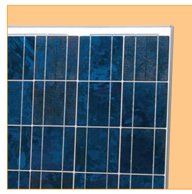
Solder-coated grid results in high fill factor performance under low light conditions.

Sharp's NE-80EJE photovoltaic modules offer industry-leading performance, durability, and reliability for a variety of electrical power requirements. Using breakthrough technology perfected by Sharp's nearly 45 years of research and development, these modules use a textured cell surface to reduce reflection of sunlight, and BSF (Black Surface Field) structure to improve conversion efficiency. An anti-reflective coating provides a uniform blue color and increases the absorption of light in all weather conditions. Common applications include cabins, solar power stations, pumps, beacons, and lighting equipment. Designed to withstand rigorous weather conditions, a junction box is also provided for easy electrical connections in the field, making Sharp's NE-80EJE modules the perfect combination of advanced technology and reliability.