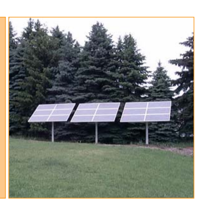
Sharp multi-purpose modules offer industry-leading performance for a variety of applications.